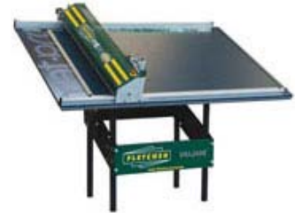
Fletcher MatPro CMC 150 Computerized Mat Cutter A Perfect Combination Of Capability and Affordability